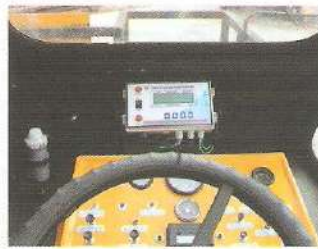
Load Indicator Safe load indicator with hydraulic cutoff (optional)