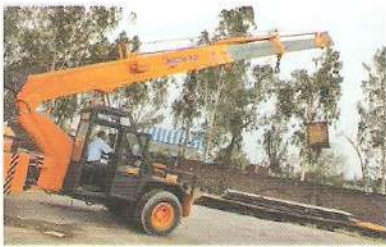
Winch Heavy duty hoist winch