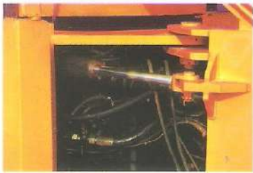
Front and Rear chassis joining Arrangement for achieving 40 deg. articulation on either side using heavy duty bearing for easy maneuverability and longer life.