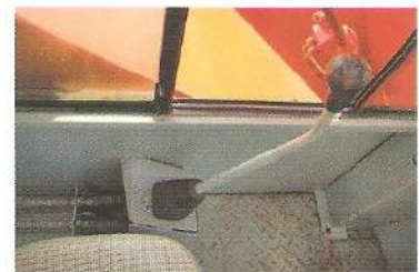
Gear Shift Gear shift through cables providing smooth gear shifting.