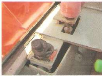
Parking brakes Pneumatically assisted fail safe brakes.