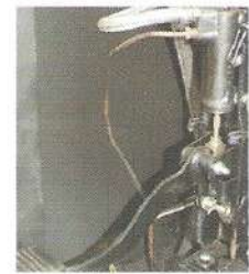
Hydraulic Clutch Hy. clutch for smooth gear shifting