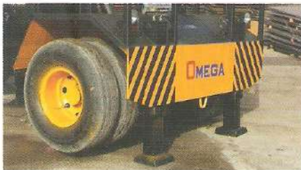
Stabilizers A special feature for maintaining stability while lifting load at maximum height