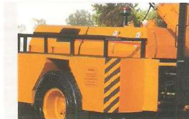
High capacity Tanks Good looking hydraulic & fuel tanks with high capacity for increased working hours.