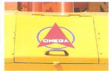
Tool box Spacious tool box for storage of tools and slings etc.