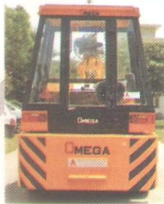
New look counter weight for better stability