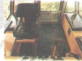
Operator friendly gear lever operation