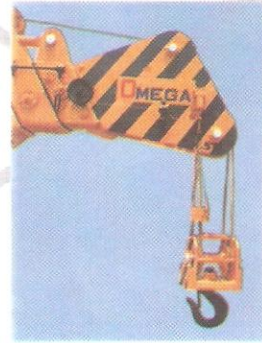
Over hoist warning system