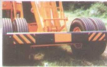
Re-enforced heavy bumper with an aesthetic look