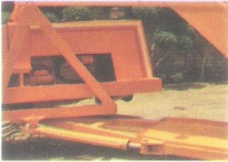
Maximum turning radius for manoeuvrability

After stringent research, keeping the practical needs in mind, we are introducing some special features which differs from others.