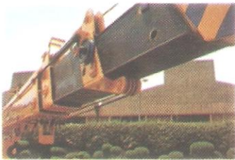
Inbuilt mechanical operated 4th ext