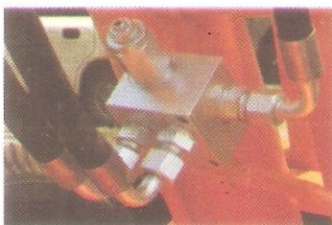
Robust & heavy duty lock valve for ultimate safety of lifting operation