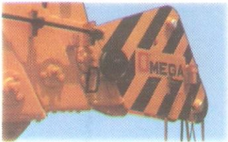
Inbuilt over extension operation warning system