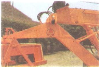
Re-enforced robust goose neck for heavy application